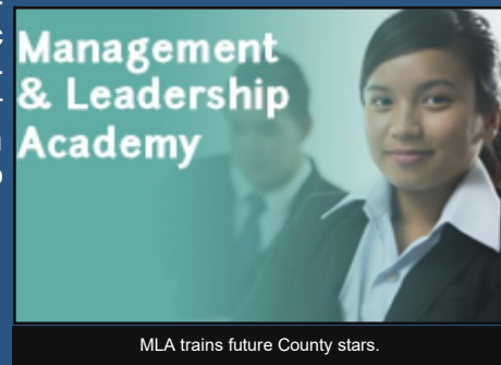
MLA trains future County stars.

In 1996, the San Bernardino County Board of Supervisors, Chief Administrative Office and department heads established the Management and Leadership Academy (MLA) to provide comprehensive management and leadership training to County employees. Those participating in MLA gain theoretical and practical knowledge of public service management and leadership practices, with specific emphasis on understanding their application within San Bernardino County.