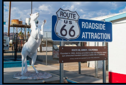
Horsing around in Amboy, CA!