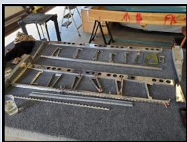
Skeletal structure of the left and right elevators of the Van's RV 14 Aircraft.

My grand project of building a plane has become bigger than I first believed. Of course, there is a lot on the line when you put yourself and your loved ones in something and shoot it into the air.