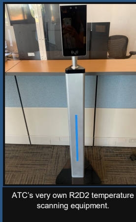
ATC's very own R2D2 temperature scanning equipment.

For information about ATC safety procedures and policies, please contact Tracy Calentti at tracy.calentti@atc.sbcounty.gov .