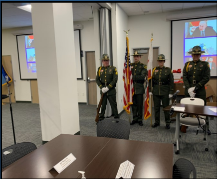
Pledge of Allegiance and Presentation of Colors, San Bernardino County Sheriff's Department Honor Guard.

conference including Alameda, Orange, Los Angeles, Del Norte, Imperial, Inyo, Kern, Nevada, Riverside, San Benito, San Bernardino, San Joaquin, San Luis Obispo, Ventura, and Yuba.